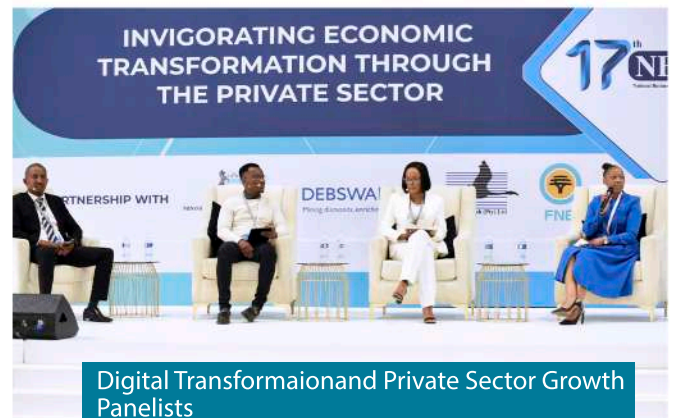
Digital Transformation and Private Sector Growth Panelists