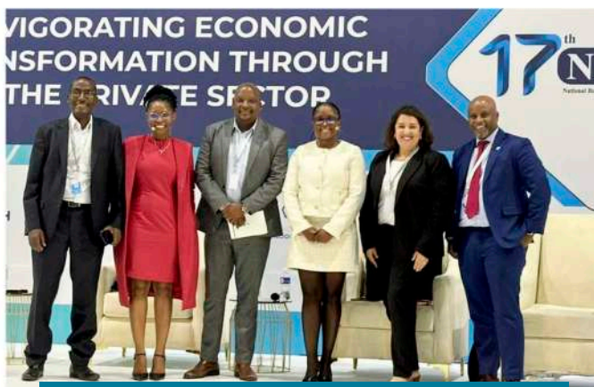
Enhancing Private Sector Growth Through Value Chain Development Panelists

Stay tuned for more updates as the conference continues to unfold, with a focus on actionable insights and strategic planning aimed at propelling Botswana towards a dynamic, export-oriented, and private-sector-led economy.